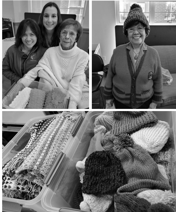
Top, senior center staff and participants show off items they made for the drive. Bottom, bins of hats and scarves collected during the drive.

Senior Centers continue to accept donations of new, clean yarn – any color, size or blend is welcome. To find a senior center near you, visit FairfaxCounty.gov/neighborhood-community-services/senior-centers . ☀