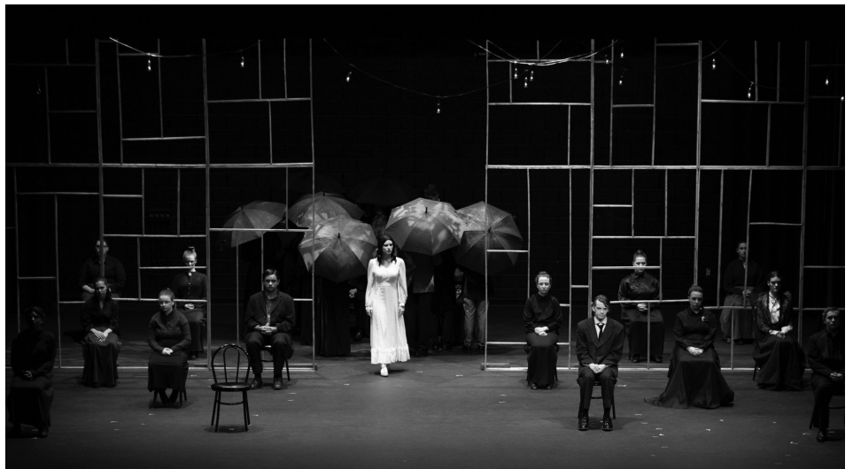
Above: a performance of the play "Our Town" by students at West Springfield High School. Right: Franklin Middle School students perform the musical "Newsies."

For a full list of upcoming performances, go to fcps.edu , then from the “Full Menu” dropdown, select “Calendars,” then “Fine and Performing Arts Events.” You can also learn about upcoming performances from signs displayed outside of schools or by calling the front office of your local high or middle school. Tickets for most performances can be purchased online and at the door. Prices vary, but most tickets cost less than $15 and some schools offer a senior discount. ☀